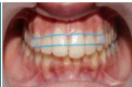
Figure 4: Clear Retainer with elastics