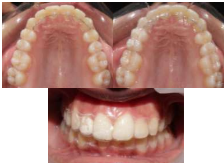
Figure 7: Post-treatment with lingual bonded fixed retainer and clear retainer