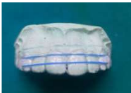
Figure 3 and