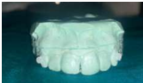
Figure 2: Clear retainer with fabricated composite buttons