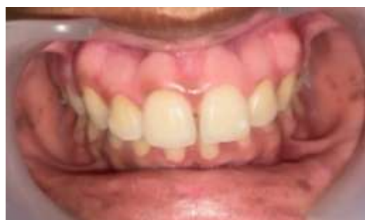
Figure 12: After 17 days of treatment