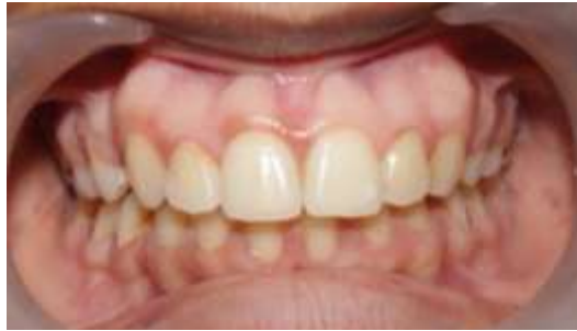
Figure 13: After 24 days of treatment