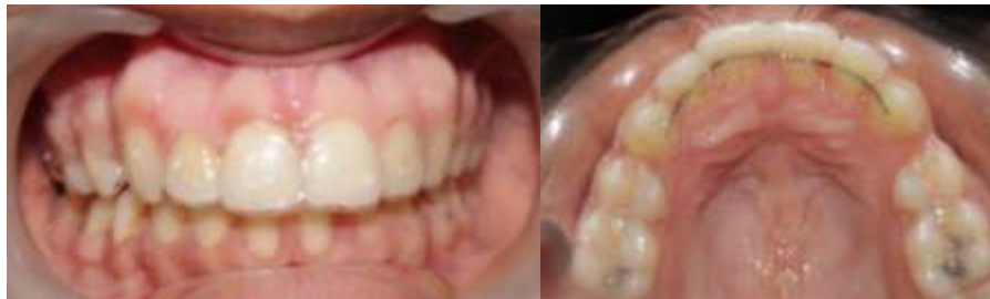
Figure 14: Post-treatment with lingual bonded fixed retainer and clear retainer