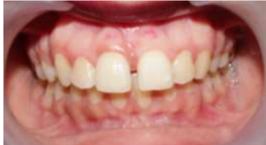
Figure8: Pre-treatment photograph

A fixed lingual retainer from maxillary canine to maxillary canine was given along with a clear Essix retainer for retention (Figure14).