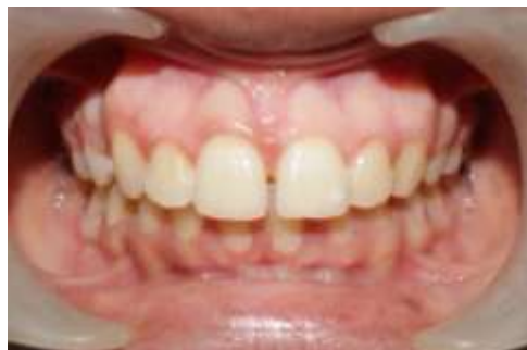
Figure 11: After 7 days of treatment