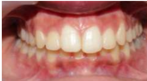
Figure 6: After 2 weeks of treatment