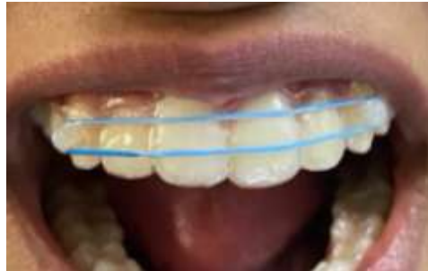
Figure 5: After 1 week of treatment