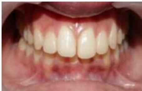
Figure 1: Pre-treatment Intraoral Photograph showing midline diastema

For this particular case, a total treatment period was two weeks. The final Impressions were made and intraoral photographs were taken, the patient displayed closed diastema with well maintained dental relationship which shows an attractive and pleasing smile.