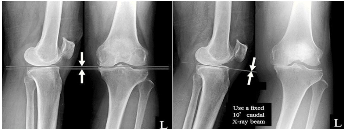
Fig. 4. The Medial joint space width values were smaller on the fixed flexion view(FFV) than on the standing extended view(SEV) for all patients. L: left.

In contrast, another study reported a higher concordance rate of K-L grade assessed on the SEV and FFV 7 : of the knees classified as K-L grade I on the SEV, 92% were classified as grade I and 8% as a higher grade on the FFV; of the knees classified as K-L grade II on the SEV, 85% were classified as grade II and 15% as a higher grade on the FFV; and of the knees classified as K-L grade III on the SEV, 96% were classified as grade III and 4% as a higher grade on the FFV. Differences between study results may have been affected by differences in the subject age, number of knees, measuring method, and physique.