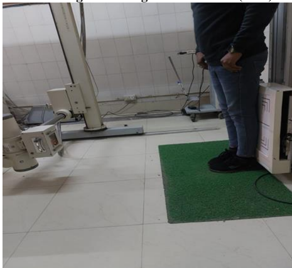
Fig.1.Standing Extended View(SEV)