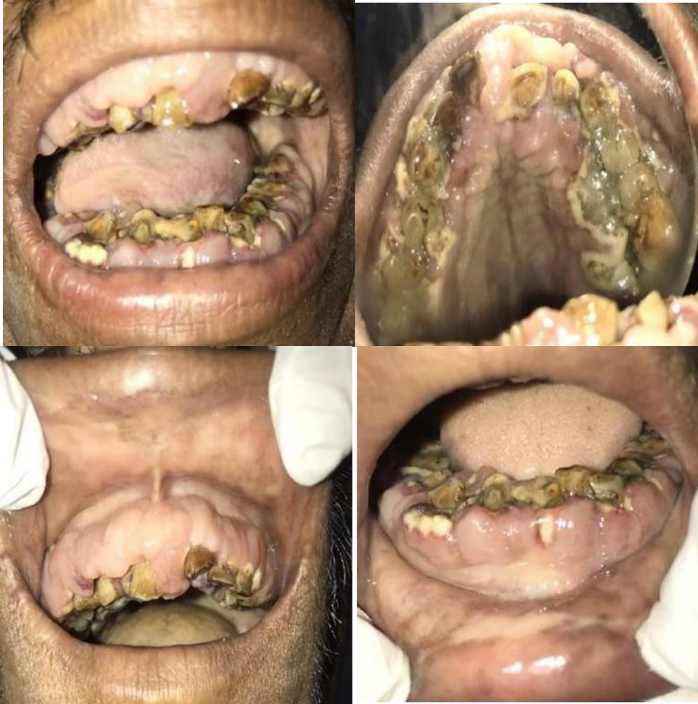
Image Showing Generalised Gingival Enlargement In Patient