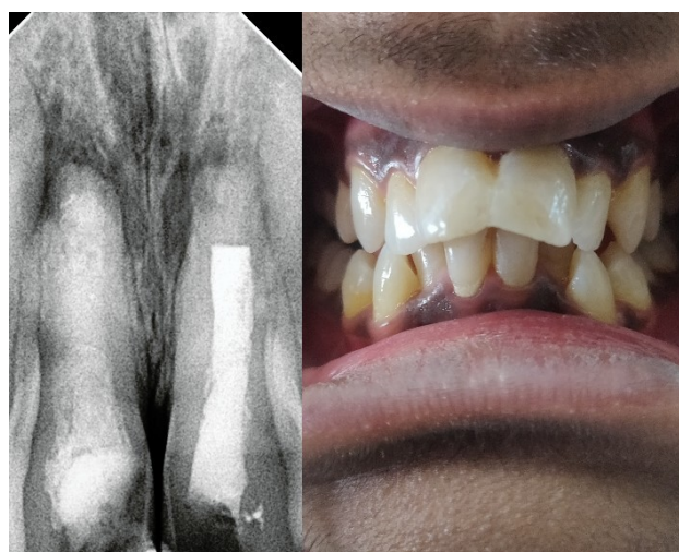
[A, B] Six months follow up

In #21 after drying the canal, Biodentine was mixed according to the manufacturer's instructions and condensed incrementally into the canal to create apical plug. Subsequent increments were condensed against the wall with a prefitted hand plugger until the thickness was confirmed radiographically to be 4 mm. After placing Biodentine, the butt end of a paper point was used to remove any excess material from the walls. After 12 minutes, the hardness of the Biodentine was examined using a plugger to confirm its set. The remainder of canal was backfilled with injection- moulded thermoplasticized gutta percha (Calamus Dual, DENTSPLY) and bio ceramic sealer (Pro Root MTA sealer). The access cavity was then restored with GIC. Patient was recalled after six months. [Figure 2]