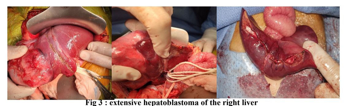
Fig 4: lacing of the various pedicle elements Fig 5: hémostase assurée par surgicel et suture des berges