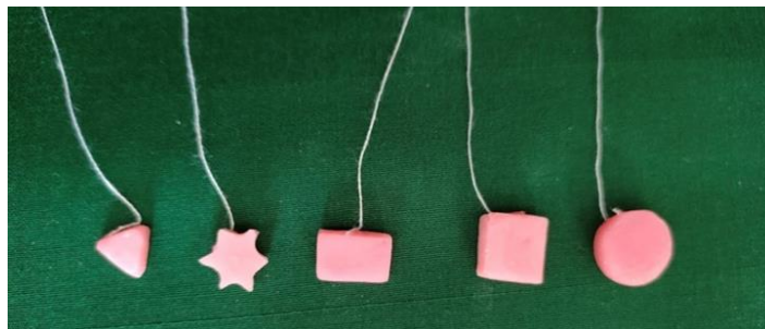
Fig. 1: Triangle, star, rectangle, square and round shape was chosen from the 20 shapes designated by the National Institute of Dental Research.

Oral stereognosis assessments were conducted at multiple time points: at the outset of the treatment, during denture delivery, and subsequently at one month, three months, and six months following denture delivery.