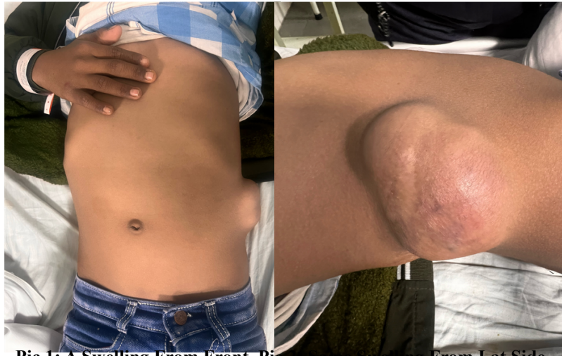
Pic 1: A Swelling From Front, Pic 2: Same Swelling From Lat Side