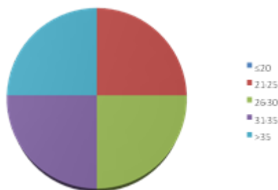
Figure 2: Distribution of patients According to the age who tested screen positive.

Out of 115 participants, second degree consanguineous marriage was represented in 6% of them and third-degree consanguineous marriage was represented in 2.7% of them and 113 participants had no h/o consanguinity. (Table 3) (Figure 3).