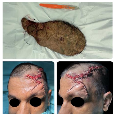
Figure 4: Immediate Postoperative Results

DOI: 10.9790/0853-2306121719 www.iosrjournals.org 18 | Page