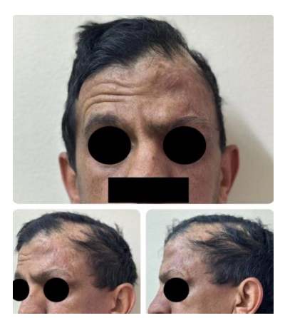
Fig 5: Late Postoperative Outcomes