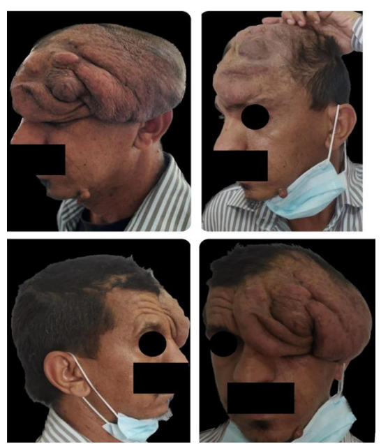
Fig 1: Preoperative Aspect Of The Neurofibroma And