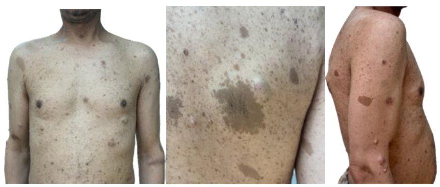
Fig 2 : Café Au Lait Skin Lesions