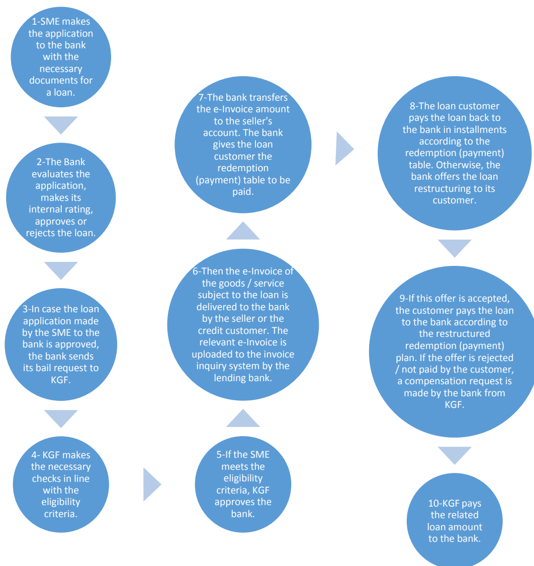
Figure 3. Model Proposal in Portfolio Guarantee System

As seen in Figure 3, in our model proposal; SME makes the application to the bank with the necessary documents for the loan. The bank evaluates the loan application, performs the necessary controls and internal rating, approves or declines the loan. KGF carries out the necessary checks in line with the eligibility criteria and if the SME meets the eligibility criteria, KGF approves the bank. Then the e-Invoice of the goods / service subject to the loan is delivered to the bank by the seller or the credit customer. The relevant e-Invoice is uploaded to the invoice inquiry system by the lending bank. The bank transfers the e-Invoice amount to the seller's account and gives the credit customer the redemption (payment) table that must be paid. The loan customer repays the loan to the bank in installments according to the redemption (payment) table. Otherwise, the bank offers the loan restructuring to its customer. If this offer is accepted, the client pays the loan to the bank according to the restructured redemption (payment) plan. If the offer is rejected / not paid by the customer, the bank claims compensation from KGF and KGF pays the relevant loan amount to the bank. In addition, KGF recommends that the Revenue Administration e-Invoice Inquiry be made in order to question the authenticity of the invoice.