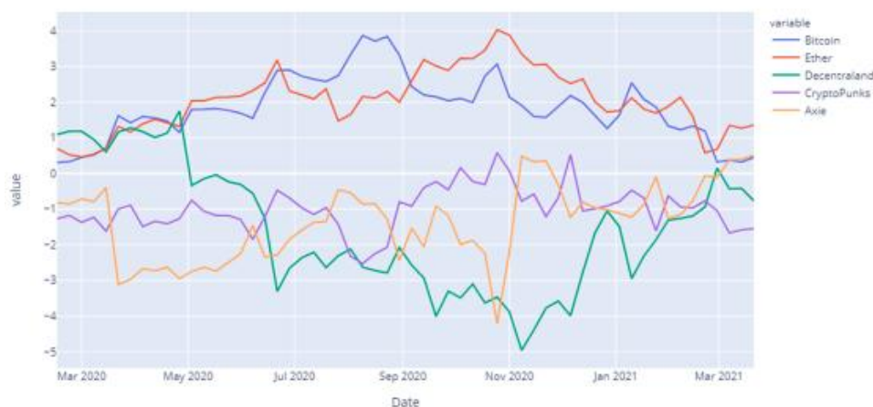
Fig. 2. Rolling (50-week) net spillovers for all NFTs and cryptocurrencies, February 2020 to March 2021.

Figure 1 emphasises the large 2021 run up in prices for both cryptocurrencies and NFTs, although the price rise of NFTs appears more abrupt.