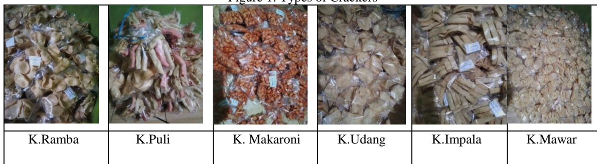
Figure 1. Types of Crackers

Crackers Ramba Crackers Puli Crackers Macaroni Crackers Shrimp Crackers Impala Crackers Rose Crackers. Mas Warno's cracker business can be said to have grown since the establishment of the business until now. This can be seen from the increasing number of production, labor and marketing area which reaches more than a thousand packs per day. This can be seen in the following table: