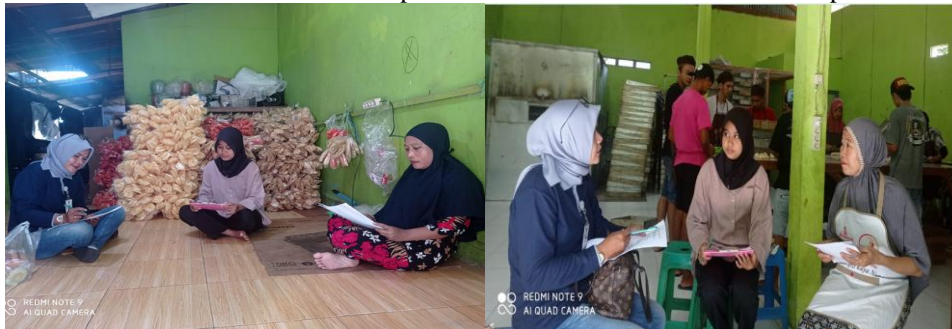
Figure 2 Activities for the Implementation of Financial Statement Preparation

The calculation of profit and loss that has been calculated is as follows: