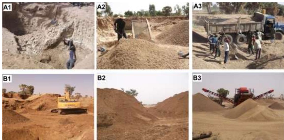
Figure 3: the techniques and equipment used in quarry operations

The next step is sieving, which is done using the sieve with mesh sizes ranging from 5x5 to 7x7 mm 2 for the 0.6 and from 7x7 to 12x12 mm 2 (Figure 3A2). It consists in removing from the gravel called first choice the 0.6 (diameter < 7 mm) and silt - clay - sand fractions, both of which constitute the second choice. The latter, depending on the market demand, can be subjected to a second sieving with tighter meshes in order to recover the 0.6 fraction (gravel). It is clear from the above that gravel exploitation in the river valley is intensive, whereas in the highland areas it is extensive (Figure 3A3).