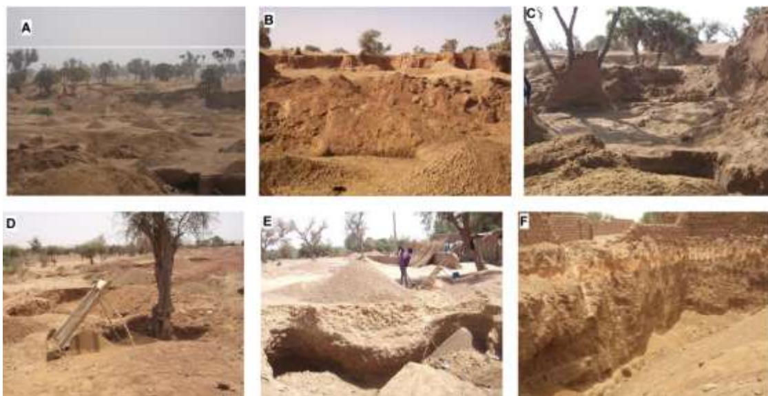
Figure 4: badlands from quarries exploitation

The quarries are located along the RN 1, road Niamey - Tillabery (Figure 1) often at a distance of only 10 m. This situation could impact the stability of the infrastructure. The landscape is marked by large heaps of excavated material materializing a new dynamic in the relief. In addition, the removal of material has created badlands-type landscape. This could lead to a disruption of rainwater runoff. The weakening of the surfaces could be favorable to the development and densification of the drains which contribute to the silting up of the river.