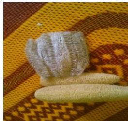
Plate 5: Sponge at Dandogo, Katsina State