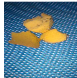
Plate 6: Old foams at Yan Tumaki, Katsina state

Table 3 shows the various order of utilization of the local alternatives. Stover (stalk and leaves), barks/stump/twigs, sticks and hay/straw/thatch were found to be in the category of highly utilized local alternatives. It was clearly found that, there were no other alternatives identified in the area that were not utilized by the people