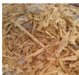
Plate 4: Bagasse piled at Anka, Zamfara State