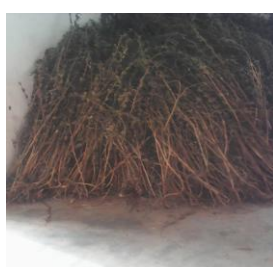
Plate 2: Grasses and hay piled for drying at Gumel, Jigawa state