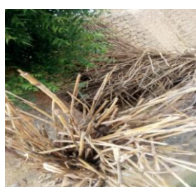
Plate 1: Stover piled at Gumel, Jigawa State

The dominant local alternatives found in all the settlements were stover and grasses and hay (plates 1 and 2), doum palm fruit and bagasse (plate 3 and 4) were less dominant while sponge and Old foams (plate 5 and 6) were found to be absent in most of the study locations. It was observed that the sources of these local alternatives are mainly from the farm, forest and markets and are mainly from agricultural i.e. crop residues and animal wastes [7].