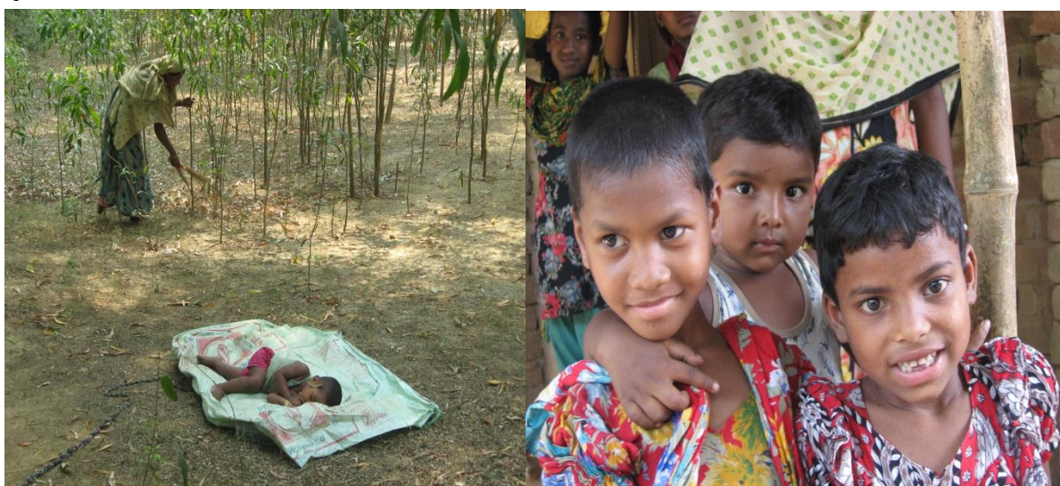
Fig 2: Collection of Dead Leaves Fig 3: Tribal Children