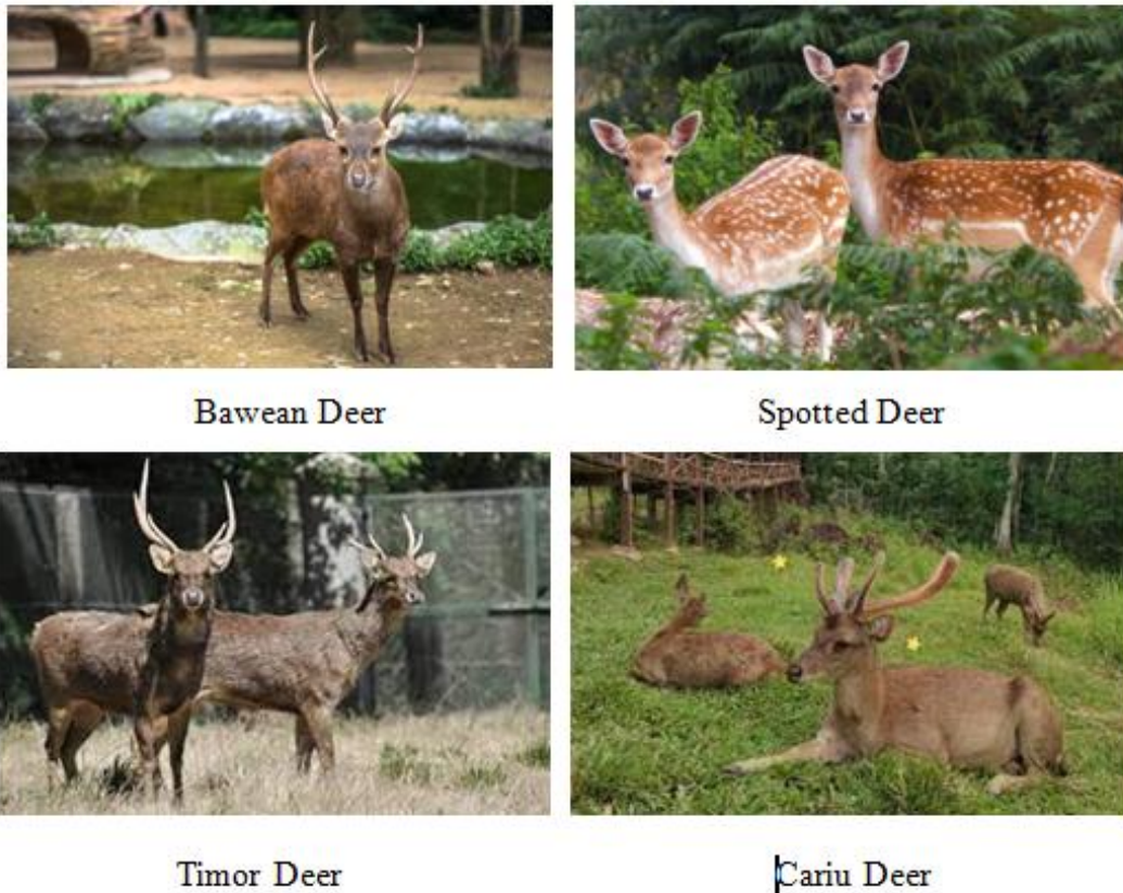
Figure 5. Several Varieties Of Deer For Edufarm Attractions

The T-S strategy shows that 1) it is necessary to apply the principles of sustainable tourism in the practice of tourism development in Sungai Pisang; 2) need to arrange visitor management; and 3) it is necessary to diversify integrated tourism products. Sustainable tourism needs to be implemented in order to provide sustainable economic benefits for the community by creating integrated tourism products, thus making it easier for tourists to carry out tourism activities.