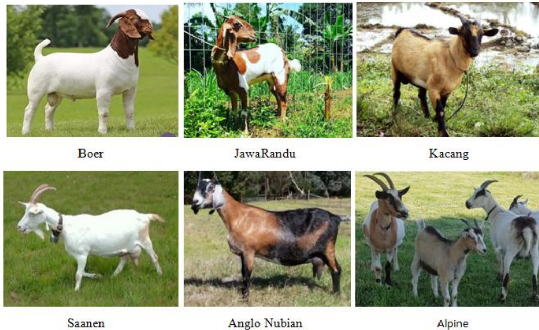
Figure 3. Several Varieties Of Goat for Edu-farm attractions

varieties of goats (Etawa Goats, Boer Goats etc.), various varieties of rabbits (Giant German rabbits, Giant Flemish etc.), various varieties of deer and other livestock that do not harm visitors. The development of this attraction needs to involve the surrounding community so that the economic benefits can also be felt by the community. In addition, it is necessary to pay close attention to the maintenance of the health of livestock (vaccination and vitamin supplements) so that they are not easily exposed to disease and to manage the waste of manure from the livestock so as not to disturb the surrounding environment.