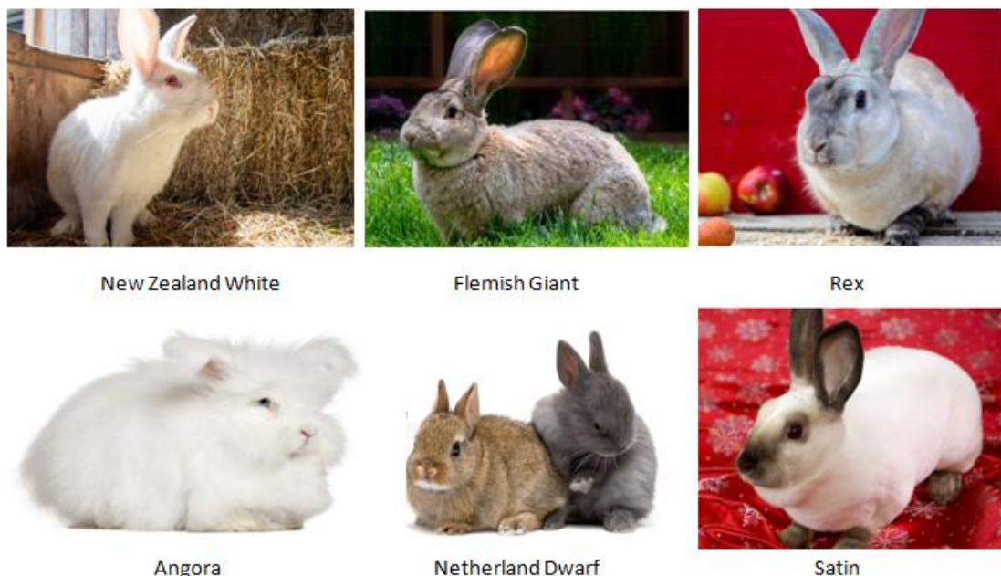
Figure 4. Several Varieties Of Rabbit For Edu-farm Attractions