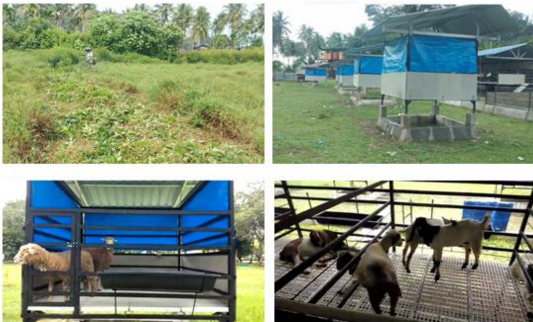
Figure 2. Farm Land In The Sungai Pisang Area

A SWOT analysis in the development of educational tourism needs to be carried out to create strategies and assessing the readiness of an area/region in carrying out tourism activities. The purpose of a SWOT analysis on tourist sites is to see the strengths, opportunities, weaknesses and threats of tourist sites that will be developed and can be used as a guide to minimize weaknesses and threats that may arise in the development of Edufarm that supports marine tourism in that place. Strength and weakness factors arise internally while opportunities and challenges arise externally. The strategy of developing Edufarm Attractions (Edutourism) in the Sungai Pisang area as a marine tourism attraction can be analyzed using SWOT analysis. The SWOT analysis will be described in Table 2 to develop a strategy for developing Edufarm Attractions (Edutourism) that supports marine tourism in the Pisang River area.