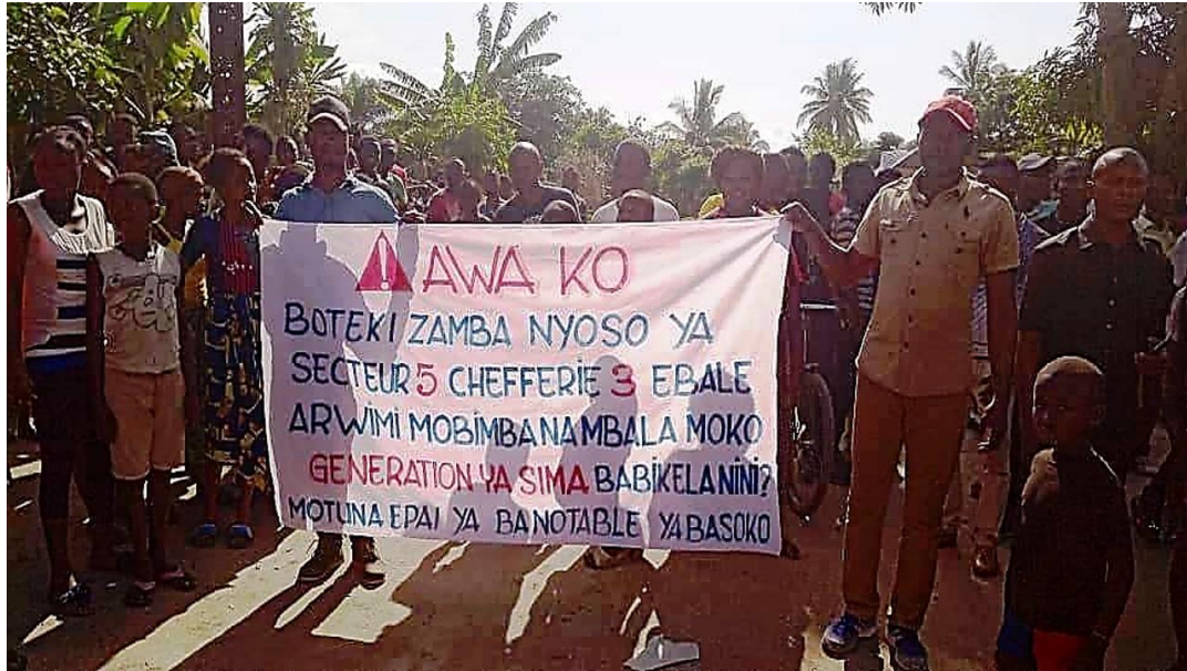
Figure 2. The population of Basoko says no to mineral exploitation by Xiang Jiang Mining SARL in Liambi

When the two decrees of the Minister of Mines granting research permits to Xiang Jiang Mining SARL overlap on territories that are in fact villages in which the people of Basoko, in particular those of the villages Liambe and Likombe, have lived for centuries, this is, in fact, a violation of the right to individual property. This population is now being forced to leave the land they have occupied for centuries to move to a new land. Living mainly from fishing around the Congo River and the Aruwimi River, people are forced into the forest where they may face enormous difficulties of survival because they will have been deprived of all their means of subsistence for their families.