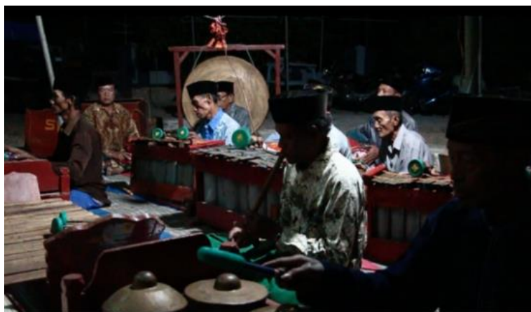
Figure 2. Madura Gamelan Accompaniment

In the context of the social gathering event, the stories presented are generally popular, such as Juhar Manik and Murtasih. The format of the performance is more free, it can be in the form of reading alone, accompanied by a flute instrument, or it can also be accompanied by a Madurese gamelan format. As in the social gathering event in Saronggi, Sumenep Madura, which uses gamelan accompaniment in the reading of Juhar Manik's story.