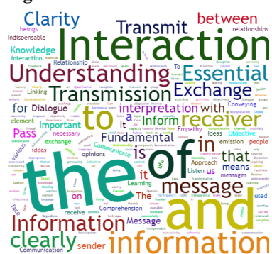
Figure 1- Cloud of evoked words