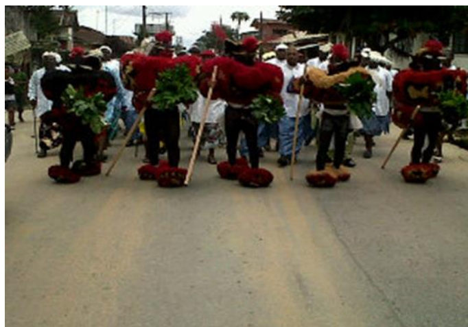
Fig I: Ekpe Masquerade (Cross River State).