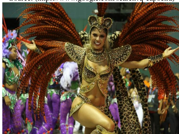
Fig.5: Rio de Janeiro Carnival