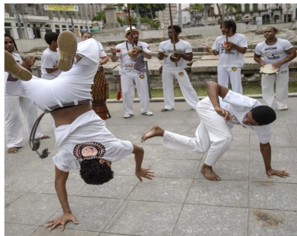
Fig.4. Capoeira Martial Art Dance

Capoeira in (fig.4) was introduced by black slaves in Brazil mainly from Angola and it was invented around the 16 th century (Basominger, 2012). Capoeira (fig.4) is about 500 year old art form and thought to have originated in the 16 th –century A.D by enslaved people (Kingsford-Smith, 2021).Capoeira (fig.4)developed in Brazil, derived from traditions brought across the Atlantic Ocean by enslaved Africans and fueled by the burning desire for freedom (Goncalves-Borrega, 2017). Conclaves-Burther stressed that, “it soon became widely practiced on plantations as a means of breaking the bonds of slavery, both physically and mentally.’Conclaves-Borrega concluded that, the art was considered a social infirmity and prohibited officially by Brazilian penal code, the word became a synonym for ‘bandit’, ‘thief’ but the capoeiristas did not stop practicing, they move to marginal places and camouflaged as the martial art as dance. Capoeira borrows from African traditional wrestling and blends with song dance and fighting. Now all nationalities can learn the Capoeira martial art dance due to trans-Atlantic African slave trade. Capoeira Angola is a slower movement close to the ground, while Capoeira Regional is fast movement standing up tall and capoeira means ‘short grass’ (Capoeira History, undated)