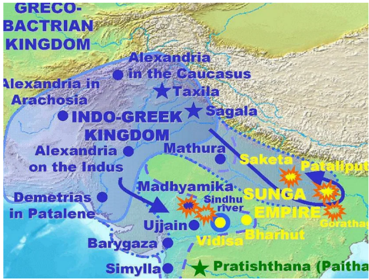
MAP DESIGNED BY PHGCOM (credits-world history encyclopedia)