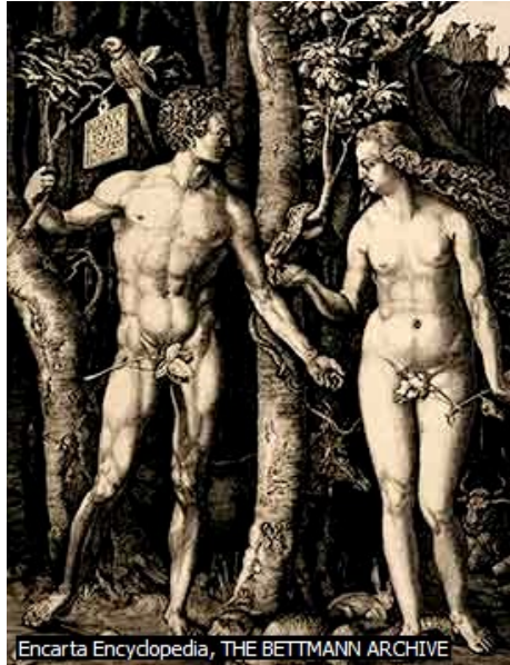
Fig. 1, Albrecht Dürer, Adam and Eve (1504), Engraving

Rembrandt's etching titled "Abraham entertaining the angels" (1656), captures the event described in Gen. 18:1-10 lucidly. Sarah is shown watching the three men from inside the tent while Abraham waits on them. He however does not know that they are angels. Of Isaiah's encounter, (Isaiah 6: 2-4) we are left in no doubt as to the fact that the "flaming creatures" are angels and that they bear wings; in this instance six each. Angels are included in this animal categorization for the simple fact that they bear wings, apparently with a semblance to those of eagles. No derogation is intended.