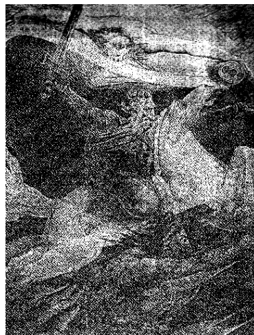
Fig. 2, William Blake, Death on a Pale Horse , circa 1800, Pen and Watercolour over Pencil, 39.5 x 31.1cm, (Source: Lister 1986)

The first reference to animals in the Bible is found in Genesis 1:24 where the creation of animals on the sixth day precedes the creation of man later the same day. It is logical then that a serpent be responsible for the temptation of Eve. Dürer captures the moment succinctly for us in an etching depicting Adam and Eve in the Garden of Eden covering their nakedness with leaves while Lucifer is coiled up in the branches of the tree (Genesis 3:1-20) (see Fig. 3 below).