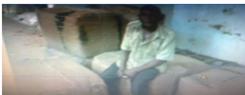
Figure A6 A1 farmer sitting on baled tobacco in Ingwenya Farm, Goromonzi District.