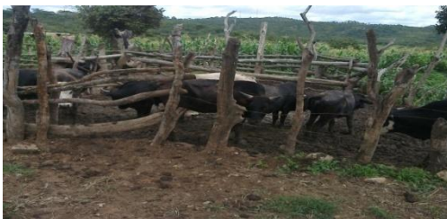
Figure A3 Cattle owned by A1 farmer in Bains Hope, Goromonzi District.