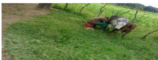
Figure A9 A farm worker milking a cow.