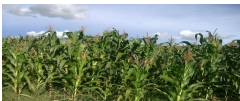
Figure A8 Part of maize crop in Ingwenya Farm, Goromonzi District