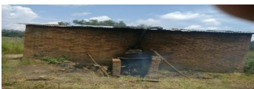
Figure A7 Tobacco Barn in Bains Hope, Goromonzi District