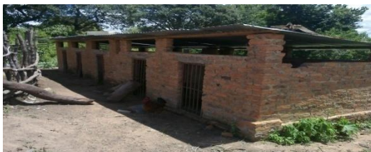
Figure A4 A pigsty in Bains Hope, Goromonzi District.