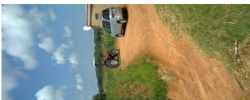
Figure A5 Assets acquired by A1 farmer in Bains Hope, Goromonzi District.