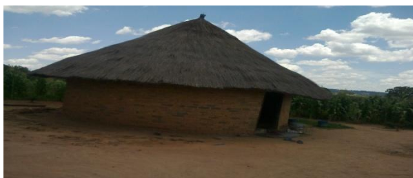
Figure A2A kitchen hut in Ingwenya Farm, Goromonzi District