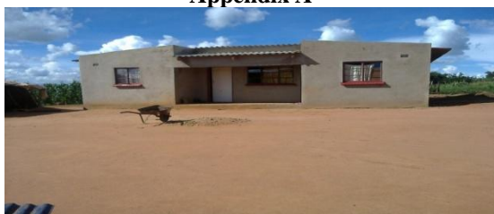
Figure A1: A newly built modern house in Bains Hope, Goromonzi District.