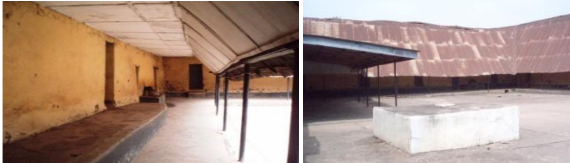
Plate 11: A stretch of corridor/veranda at the Oke-Emese Courtyard

Like many of the courtyards, Oke-Emese (literally royal messengers' quarters) is rectangular-shaped with very large corridors. The roof-covered corridors are arranged in a line round the entire courtyard, leaving a smaller rectangular space in the middle. The high roofs are supported with carved posts or pillars. At the centre of the courtyard (which also houses the administrative office of the emese) is a raised platform called ara'lu. The ara'lu (figure 12) is the site where coronation rites are performed for newly-appointed chiefs. The courtyard immediately after exiting Oke-Emese is Odi-Koto. At the centre of Odi-Koto courtyard is the shrine of Ogun, the main deity associated with the palace. In fact, an old sword on an elevated platform called 'opo' in Ode-Odu courtyard presents Ogun as the arbiter whenever communal disputes are brought before the Owa.