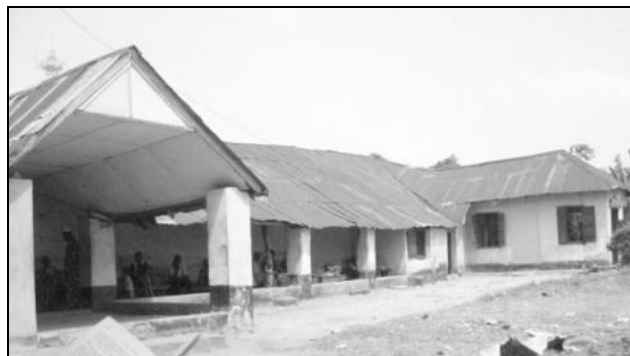
Plate. 1: A view of Owa's Palace. Photograph by Michael Olusegun Fajuyigbe (2007)

Ilesa is a Yoruba city-state located in the south-western geo-political zone of Nigeria, in the Yoruba Hills and at the intersection of roads from Ile-Ife, Oshogbo and Akure, which fall within Latitude 8.92°N Longitude 3.42°E. Ilesa, the capital of Ijesa kingdom and one of the larger Yoruba towns, was founded in the early 16th century. The city is situated in between the larger regional centres of Oyo and Benin, around the upper reaches of the Osun, Sasa and Oni rivers (Peel 1979). It is bounded in the south by the forest of Oni valley, in the north by Imesi-Ile, in the west by Osu and in the east by the Ekiti country. Located in the centre of two Ijesa Divisions (present Obokun and Atakumosa Local Government Areas), Ilesa is the metropolitan city of the Ijesa people. It is a classic example of a celebrated Yoruba town with a "crowned head"; it is ruled by a monarch bearing the title of Owa Obokun, Adimula of Ijesaland. The foundation history of the Ijesa people is similar to the "form of a dynastic migration from Ile-Ife, the sacred centre of Yoruba mythology". Peel (2002) asserts that Obokun, the youngest son of Oduduwa Olofin volunteered to fetch sea-water to cure his father's blindness. However when he returned, he discovered that his father had given his elder brothers all the crowns and treasures; hence, there was nothing left for him except a sword "ida ajase" (sword of conquest) which his father gave him to wage war against his enemies.