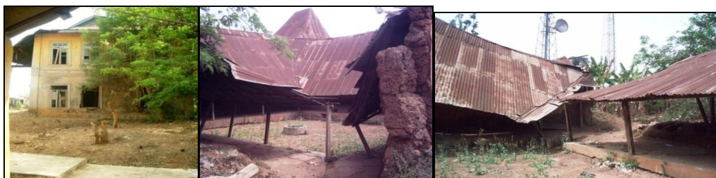
Plates: 6, 7 & 8: Abandoned structures and dilapidated courtyards.

Owa’s palace - the old afin in particular - features several courtyards ( akodi ), verandas, porches, impluvia, drainage, rooms, roofs, doors and expansive gardens. The old palace structure is traditional in design, and the cultural artefacts referred to here are found in the old palace. The recent palace structure, located to the left side of the main entrance, is modern in design. Very little changes are noted in the old palace at Ilesa; sometimes, tourists are filled with awe and admiration, gazing at the architecture that is about seven centuries old. Walls, in some courtyards, remain as naked as they had been from primordial time. Its grandeur has seriously diminished due to a lack of maintenance culture (figure 6). It is therefore crucial to challenge all stakeholders about the need to salvage the situation without necessarily obliterating the evidence of rich cultural cum artistic heritage of the Ijesa people.