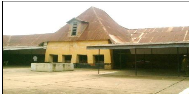
Plate 9: Oke-Emese Courtyard

sculpted doors, walls and house posts". The courtyards are many, numbering about fifty; while few of the courtyards are still intact, many have become dilapidated and several have collapsed completely (figure 7 & 8). About 50% of the palace courtyards, gardens and surroundings are in this state. This state of negligence is most probably because the slaves who were used in maintaining the cleanliness of the palace surroundings are no longer available. The courtyards' doors are made from a large plank in purely traditional style; and the doors are fixed to the wall with hinges made by the local blacksmith. The palace is divided into several courtyards, each containing living rooms and special rooms. For instance, the Ode-Royin courtyard has a sacred apartment called 'osanyin' room where the king-elect is expected to observe a vigil, prior to his coronation. Also, at Ode-Odu courtyard, a room is dedicated for the safe-keeping of Owa's paraphernalia.