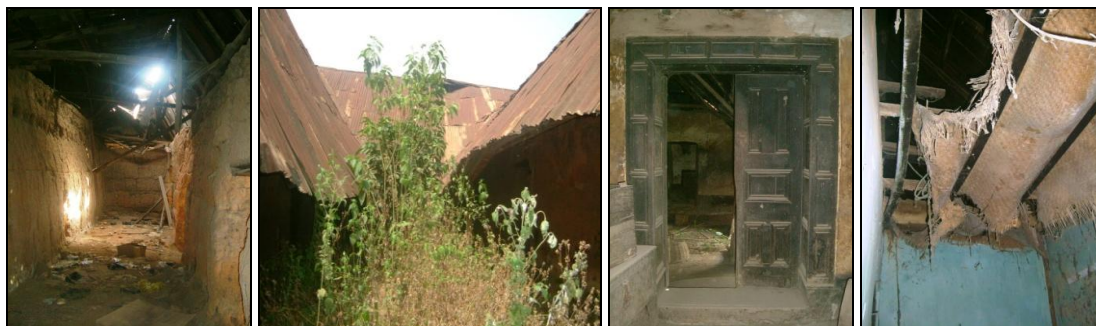
Figure 13 – 16: Architectural decadence in royal palace.

Although Ilesa is a classical Yoruba city and modern metropolis of taste and fashion, it cannot boast of an established art tradition. The well-articulated architectural designs, symbols and motifs adorning most of the buildings in Ilesa city, are a testimony to the people's industry. Even the walls surrounding the palace area have been defaced by posters and handbills.