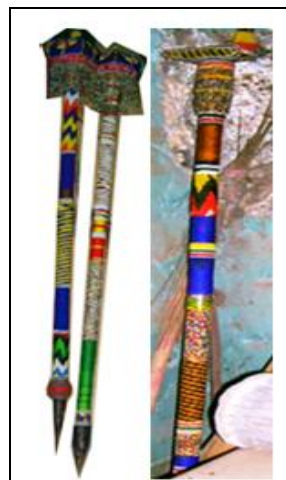
Figure 2: Beaded Royal Staff ( Opa Ase ) and Beaded Walking Stick ( Opa Ileke )

The royal paraphernalia are cultural objects that symbolise the authority of the Owa and present him as the royal father and the arch-priest of his people. Owa's art collections include ancestral and religious symbols, royal paraphernalia, and wood carvings that embellish the palace structures. These paraphernalia include the beaded crown, beaded collar, embroidered regalia, beaded staff, walking sticks, sculpted throne, ceremonial