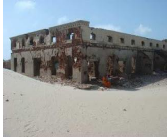
Fig 3: Old Railway station

At present roofless shattered building a church.(Fig.2) Inside, a pedestal, which could have been the altar, stands intact. A ruined railway station (Fig.3) and a temple lie among the debris. But the shells of the structures sit peacefully in dunes of white sand against a deceptively calm and sparkling blue sea. Railway office made up of stone structure standing with other buildings tells the story of the town. Overhead water tank (Fig.4) supporting structure made with stone masonry with stone lintels in between with arch was fascinating, stands next to railway station. The town also had big post office (Fig.5) built with stone masonry and brick arch openings.