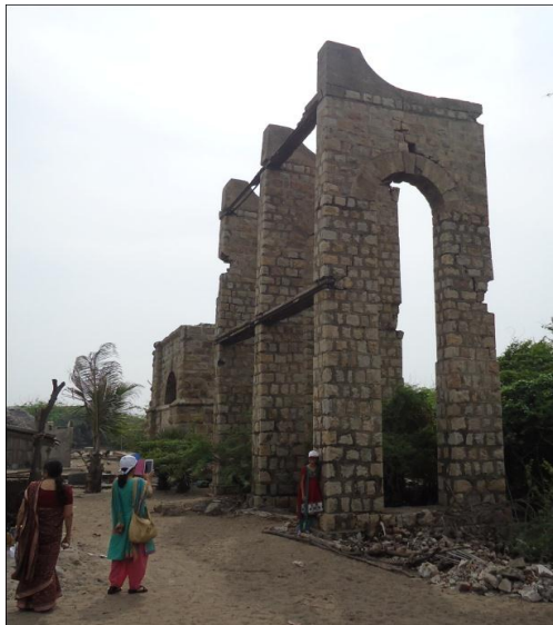
Fig.4: Remains Overhead water tank structure

At present roofless shattered building a church.(Fig.2) Inside, a pedestal, which could have been the altar, stands intact. A ruined railway station (Fig.3) and a temple lie among the debris. But the shells of the structures sit peacefully in dunes of white sand against a deceptively calm and sparkling blue sea. Railway office made up of stone structure standing with other buildings tells the story of the town. Overhead water tank (Fig.4) supporting structure made with stone masonry with stone lintels in between with arch was fascinating, stands next to railway station. The town also had big post office (Fig.5) built with stone masonry and brick arch openings.