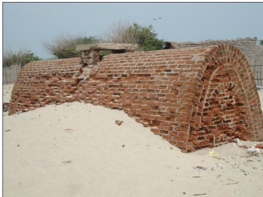
Fig 6: Storage space

All Public buildings are planned well and clustered houses placed little away but easily accessible. Most of the public buildings were built out of stone masonry walls with lime mortar, Houses are built out of brick wall masonry plastered with cement plaster.