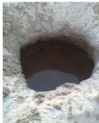
Fig. 9: Small wells provide sweet water