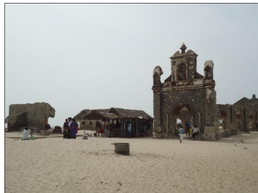
Fig 7: Ruined church with office buildings

The town had a market place, individual households or group of house households obtained their water from smaller wells. Most of the houses are ground floor structure and some of them had two stories also. All the public building had gable end wooden roof with Mangalore tiled roof. Most of the house with brick wall and thatch roof structure. Brick arch openings were used for the hospital & post office building. Brick vault structures were used for storage purpose (Fig.6) with top ventilation. Due to cyclone the tidal waves had swallowed the town and its residents. No building was intact.