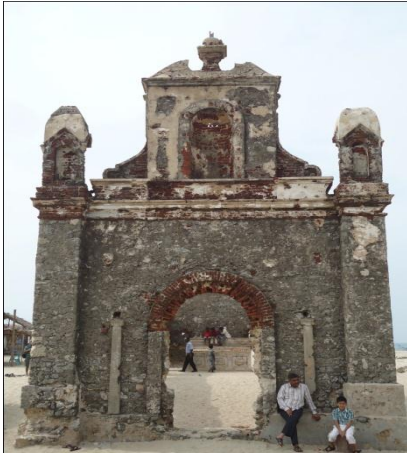
Fig. 2: Destroyed church Dhanushkodi