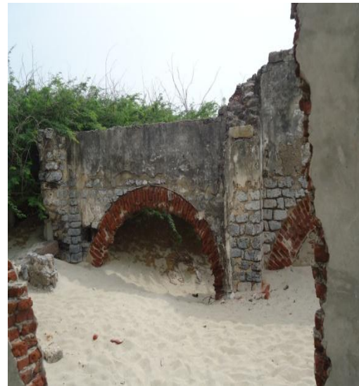
Fig.5: Destroyed post office

A scientific study conducted by the Geological Survey of India indicated that the southern part of erstwhile Dhanushkodi Township facing Gulf of Mannar sank by almost by 5 meters due to vertical tectonic movement of land parallel to the coastline. As a result of this, a patch of land of about half a km in width stretching 7 km along North-South direction submerged in sea along with many places of worship, residential areas, roads etc.