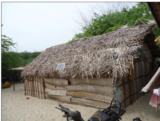
Fig.8: The Thatched huts of the fisher folk