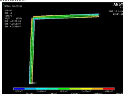
Figure 1 (a). Von Misses Stress distribution on the structure with only Pipe 289

Two cases have been considered to validate the attributions of the elements. First is an L-link constrained at both extremes in all degrees of freedom with Pipe 289 element attributed throughout the length. Second is a similar structure but elbow 290 element attributed at the bend joint. An inclined load is applied on the bend and the structure is analyzed for stress distribution on the length of the L arms. It can be observed from figure 1 (a) and (b) that although the displacement in both cases remains the same, the stress distribution and maximum stresses induced significantly vary. The second case exhibits near realistic values as experience from various experiments say that the stress distribution at the junctions is not as uniform as theoretically stated. The first case complies with the theoretical distribution functions while the later resembles a more practical distribution and transmissibility characteristics.