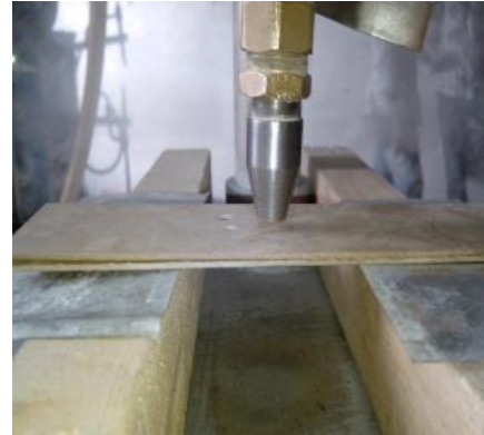
Fig 2: Impingement of mixer through Nozzle

Some of these studies gave rise to various mathematical equations developed for predicting the output parameters. Domiaty et al [3] was among the first who developed a set of mathematical model to relate the process parameters settings to the process output variables in jet technique. Later U.D.Gulhani et al [1] used design of experiments for finding optimality.