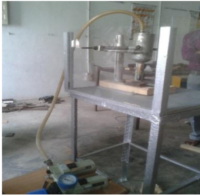
Fig 1: Setup of AJM at St Martin's Engg College