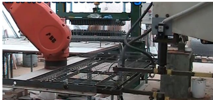
Fig 4: Welding with a Stationary Spot Welding Gun and Robot Moving Part

In this method the part is attached to the arm of the robot using a gripper so that it can be moved by the robot. Next step involves programming the robot and teaching the position of all the weld points to robots. The robot is moved to each and every weld point of the work-piece and then the co-ordinates of the weld points are taught to the robot using a teach pendant. The robot will be moving in the path exactly as it is taught. Robot moves to the weld position and the stationary welding gun will carry out the welding at the locations where it is taught.