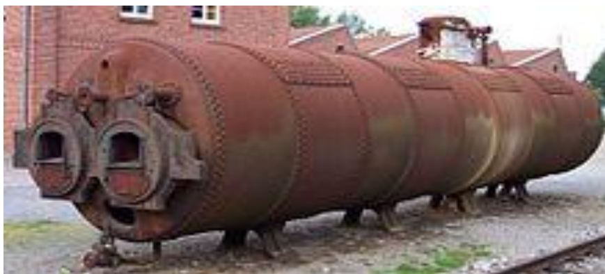
Fig. 01. Smoke Tube Boiler

Smoke tube boiler:- A smoke tube boiler is a type of boiler in which water circulates in tubes heated internally by the fire. The Smoke Tube Boiler is manufactured using the advanced technology which makes it a highly efficient Boiler. Boiler is Three Pass Fully Wet Back Type. Designed with proper grate area and furnace volume for efficient burning of solid fuels (Applicable for Solid Fuels). Good Combustion Efficiency as greater furnace diameters and furnace volumes are provided. Higher efficiencies as designed properly with required heating surface areas. Available for liquid fuels like LDO/HSD/FO/LSHS, gaseous fuels like Natural Gas/LPG/Biogas and Solid Fuels like Bagasse, Husk, Wood, Coal and other agro-wastes. Good Steam Purity up to 98% dry saturated as large disengaging surface and free board distance in boiler. Steam Quality as 98% dry saturated. Consistent and trouble free performance under 'Normal Operating Conditions'. Working Pressures of Boiler available at 7 kg/sq.cm/10.54 kg/sq.cm/15 kg/sq.cm and 17.5 kg/sq.cm for complete range of boilers for different fuels.[6,9,11]