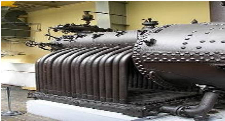
Fig. 02 Water tube boiler

Water-tube boiler:- A water tube boiler is a type of boiler in which water circulates in tubes heated externally by the fire. Fuel is burned inside the furnace, creating hot gas which heats water in the steam-generating tubes. In smaller boilers, additional generating tubes are separate in the furnace, while larger utility boilers rely on the water-filled tubes that make up the walls of the furnace to generate steam. The heated water then rises into the steam drum. Here, saturated steam is drawn off the top of the drum. In some services, the steam will reenter the furnace through a superheater to become superheated. Superheated steam is defined as steam that is heated above the boiling point at a given pressure. Superheated steam is a dry gas and therefore used to drive turbines, since water droplets can severely damage turbine blades. Cool water at the bottom of the steam drum returns to the feed water drum via large-bore 'downcomer tubes', where it pre-heats the feedwater supply. (In 'large utility boilers', the feedwater is supplied to the steam drum and the downcomers supply water to the bottom of the waterwalls). To increase economy of the boiler, exhaust gases are also used to pre-heat the air blown into the furnace and warm the feedwater supply. Such water tube boilers in thermal power station are also called steam generating units.[6,9,11]