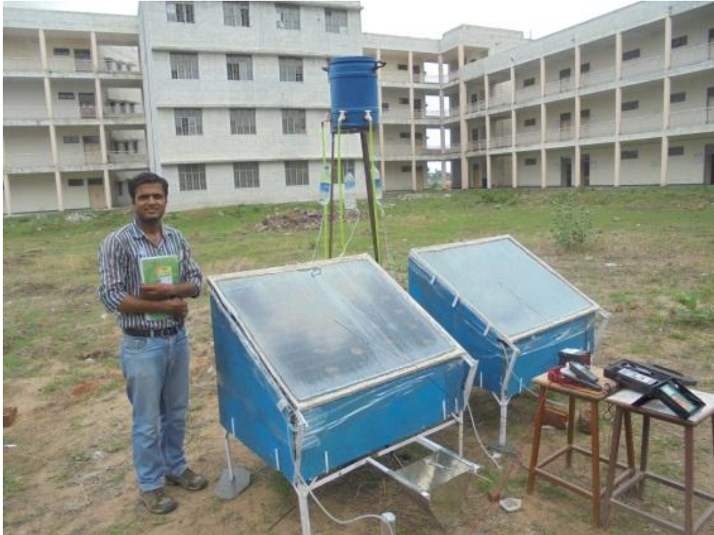
Fig.1. Experimental setup with instrumentation