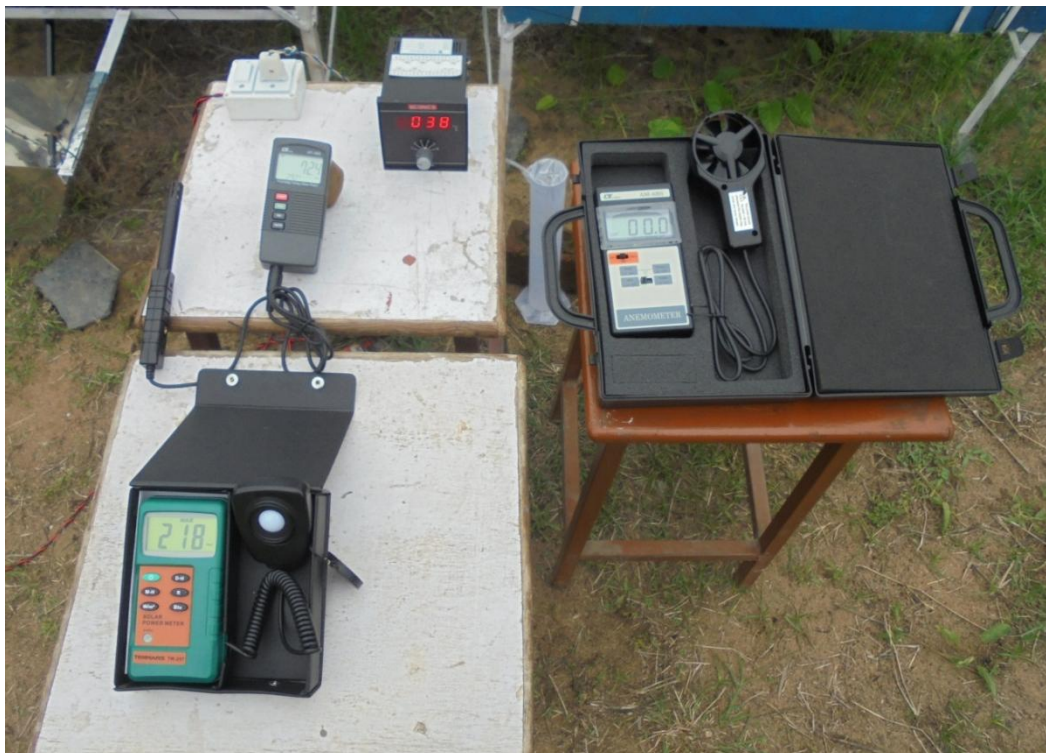
Fig. 2. Instruments used during the experiments