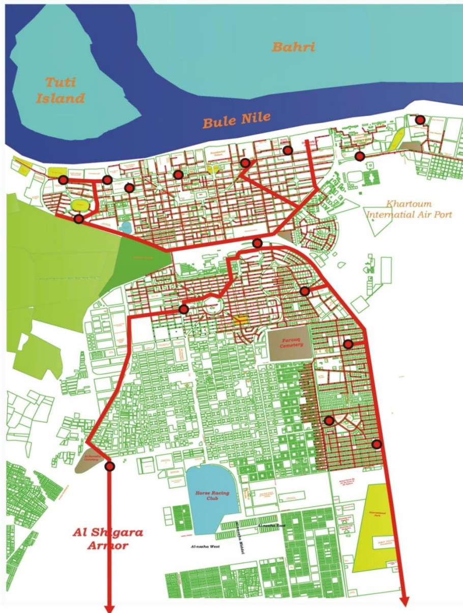
Drawing (1): Khartoum City Existing Wastewater Networks