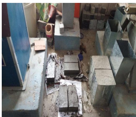
Fig 1: Raw Brick

Compressive Strength Test: This is the main test conducted to find the suitability of the brick for construction work. This test is executed with the help of compression testing machine. As per IS:3495-Part 1-1992, removed unevenness observed in the bed faces to provide two smooth and parallel faces by grinding. Immersed in water at room temperature, removed all voids in the bed face flush with cement mortar. Then the brick was stored under the damp jute bags for 24 hours followed by immersion in clean water for 3 days. Finally traces of moisture removed to make the brick ready for compressive strength test. After placing the test specimen load was applied axially at a uniform rate of 140 N/mm 2 per minute till failure occurs. The load at failure shall be the maximum load at which the specimen fails to produce any further increase in the indicator reading on the testing machine. A brick after undergoing compression test, this test is carried out for both fly ash bricks and clay bricks.