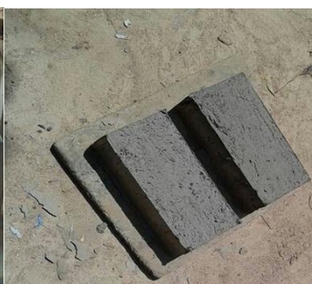
Fig 2: Fired Brick