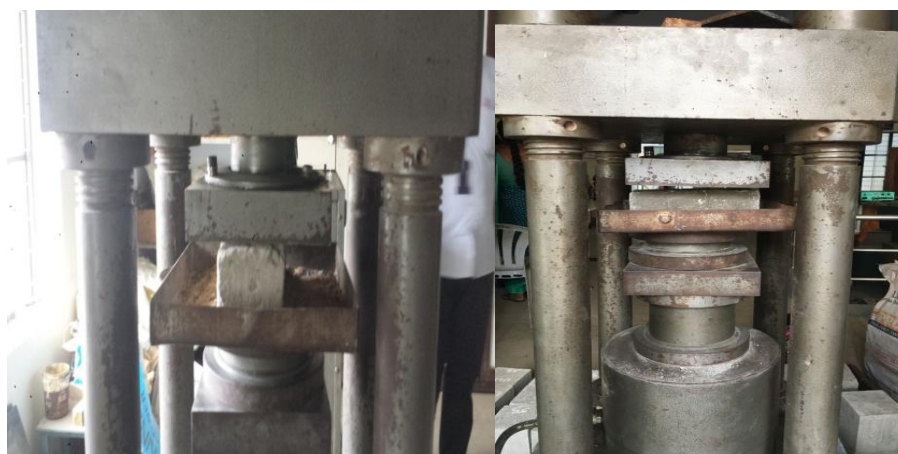
Fig 3: Compressive strength test set up for prepared specimen

Mix Proportion: To find the optimum strength of fly ash plastic brick the following mix proportion are arrived by trial and error method is given in table 1. The required quantity of materials to make one brick is considered by taking brick weight of 2.6 kg is given in table 2