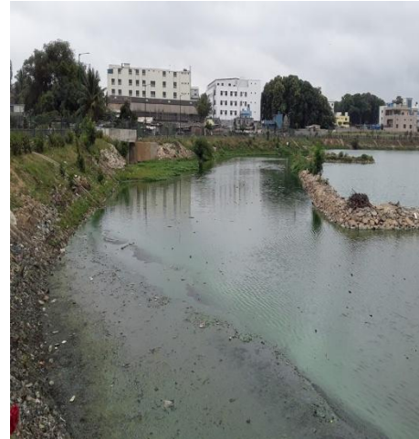
Fig. 4: contamination of the lake