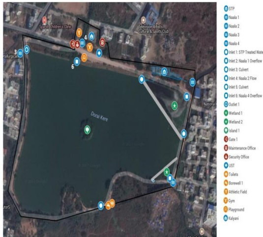
Fig. 3: Satellite view of the lake