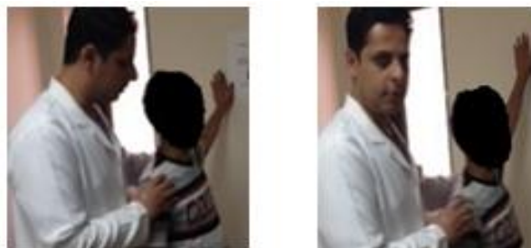
Fig 2- ROM exercise