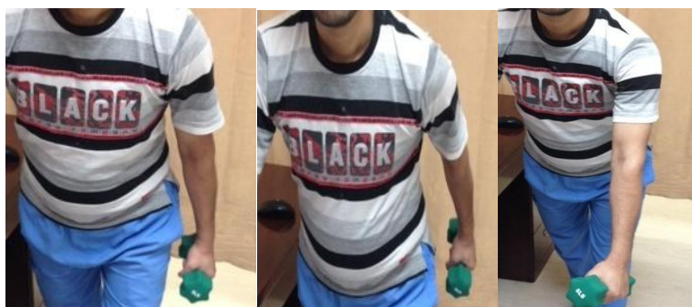
Fig 3- Pendulum exercise with 1 kg weight

Pain was assessed by VAS and MPQ before starting treatment and on 3 rd week of post treatment session.