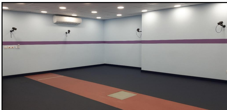
Figure (1): Eight-camera Vicon motion analysis system for 3-D gait analysis

Three-dimensional motion capture uses an eight-camera Vicon motion analysis system (Oxford Metrics Ltd., Oxford, UK). Ground reaction forces had been recorded at a rate of 1200 Hz by one AMTI force plate (OR6-5-1000; Advanced Mechanical Technology, Inc., Newton, MA) camouflaged in an eight meters pathway were used to collect kinematic data from reflective dots at 100 Hz Fig. (1) .