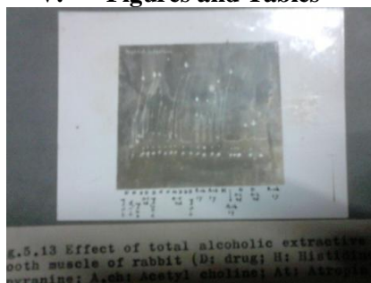
Fig1.- Effect of total alcoholic extractive on smooth muscular intestinal part of rabbit (D: drug; H: Histidine; M: Mepyranine; A. Ch.: Acetyl Choline; At: Atropine).