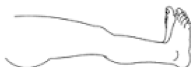
Bromage 2 (almost complete) Able to move feet only