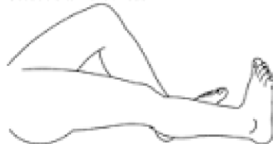
Bromage 0 (none) Full flexion of knees and feet

Assessment of sedation was done using Ramsay sedation score.