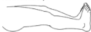
Bromage 1 (partial) Just able to move knees