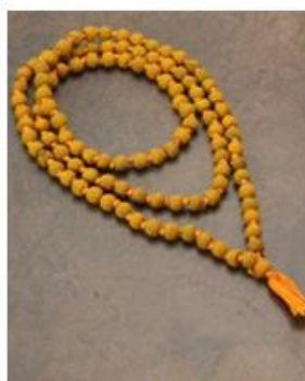
Paederia foetida mala