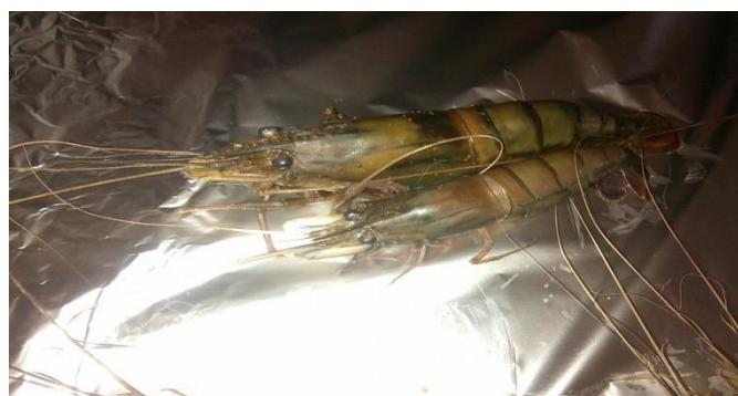
Fig 2: Pictures of fresh harvested shrimps from Ndibe beach