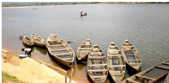
Fig: 1: Ndibe beach (River)in Afikpo North Local Government Area of Ebonyi State.

The study was carried out in Ndibe beach, Afikpo North L.G.A in Ebonyi State South East Nigeria, geographically it is located on latitude 6 0 N and longitude 8 0 E of the Greenwich meridian with the estimated population of 156,611 according to the Nigeria 2006 census.