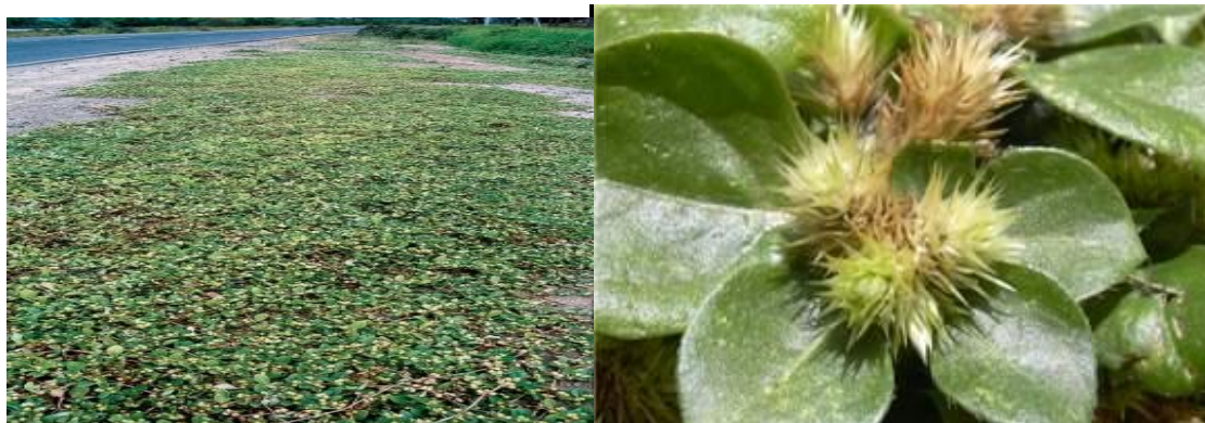
Fig.1 Alternanthera pungens grown on road side Fig.2 Leaves with bracteoles spine-tipped