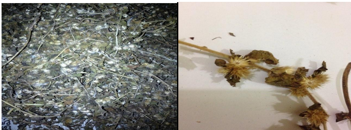
Fig.3 & 4 Dried Alternanthera pungens whole plant material