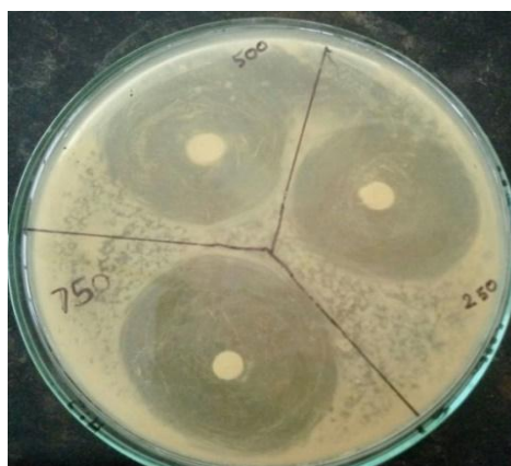
Fig: standard cefpodoxim on the Staphylococcus aureous Bacteria