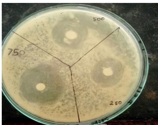
Fig: Gomutra on the Staphylococcus aureous Bacteria

The compound were for their in- vitro evaluation of antimicrobial activity was carried out by using disc diffusion method. The antimicrobial activity of was used as a standard drug and response of microorganisms to the synthesized compounds has been measured with that of the standard drug ciprofloxacin and microorganisms were selected for the study was Escherichia coli (Gram -ve), stapylococcus aureous (+ve).Were procured from Microbes Specialty Lab. The medium was suspended in 100ml of purified water. The mixture was allowed to boil till it forms a homogeneous solution. The medium was autoclaved at 121°C for 15minutes at 15psi. Media was cooled to the temperature of approximately 40°C temperature and microorganisms were inoculated to the media. 150ml was transfer to a Petri plates aseptically. Two such plates were prepared for each organism. Plates were allowed to cool for 20 minutes. Compounds were dissolved in DMSO and diluted in same to get concentration of 250µg/ml, 500µg/ml and 750µg/ml. Here both high and low strength disks were applied for each compound to be tested. The organism was reported as being sensitive if clear zone appears around both disks. Ciprofloxacin 100µg/ml was used as standard.