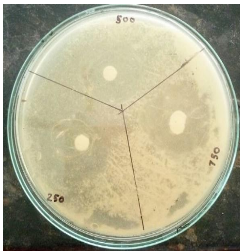
Fig . Gomutra on the E.coli bacteria