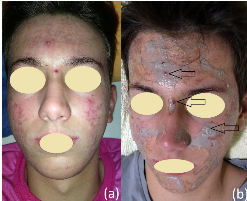
Figure 2. Patient's face (a) before and (b) after the compound application.

Figure 2 shows the patient's face before and after the compound application. Figure 2b shows three arrows pointing to the most inflamed acnes which received an extra amount of the compound to intensify the healing action.