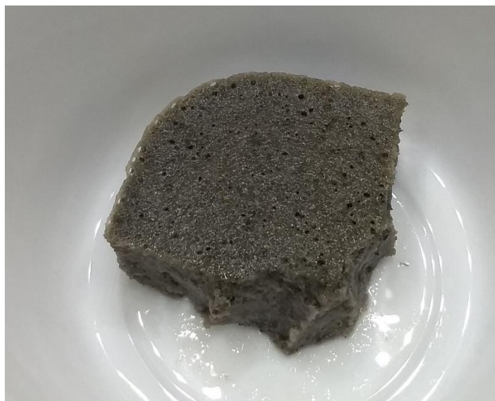
Figure 1. Compound of bullfrog skin and noni.

After sterilization, the solution was blended with 300 g of noni's pulp without seeds for about 5 minutes until obtain a smooth and homogeneous mixture. The compound was then refrigerated and stored at 2-8 °C, reaching a consistency similar to gelatin. Under this storage condition, the shelf life of the compound is about 30 days. Figure 1 shows a piece of this compound after refrigeration.