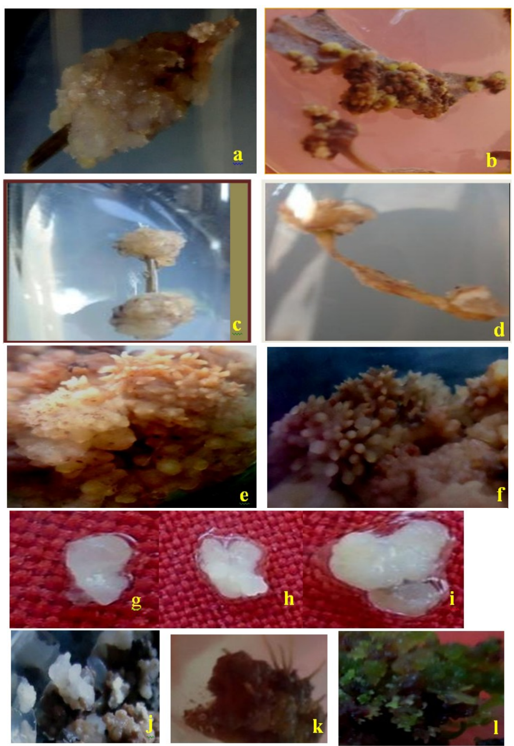
Fig 1 Callogenesis from different explants of Rumex vesicarius L and Different stages of Somatic embryogenesis a-d: Callogenesis, e-l: Different stages of Somatic embryogenesis. a: Callus induction from node b:Callus induction from leaf c: Callus induction from internode d: Callus induction from peduncle e, f : Induction of somatic embryos g: Globular embryo h: heart shaped embryo i: Torpedo shaped embryo j: cotyledonaty stage embryo k: rhizogenesis from somatic embryos l : germination of somatic embryos

Plant regeneration through somatic embryogenesis and synthetic seed production in Rumex