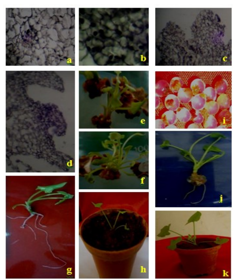
Fig 2: Regeneration of plantlets and germination of Synthetic seeds a-d:Histological stages; e-h – Regeneration of plantlets ; i-k: Production and germination of Synthetic seeds

a: Soft callus, b: Embryogenic callus, c: Section showing somatic embryos, d: Section showing differentiation of shoot bud, e: induction of multiple shoots from callus, f: Elongation of multiple shoots, g: Induction of rooting, h: Harden plant, i: encapsulation of somatic embryo; j: Germination of Synthetic seed; k : Accelimatized plant