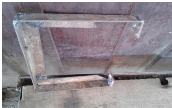
Figure. 3: Alternator Frame (3-angle bar steel)

The frame made up of 3-angle bar steel, which was cut in three different lengths (top breath 6.7 inch, base breath 6.2 inch and height 7.8 inch), was welded together joint to joint of the three joint firmly with gauge 12 electrode. This is shown in Figure 3. There was a need to use the square bar to check if the 3-angle bar is perfectly square. This will make the angles to be at 90° to one another, before securing a permanent welding.