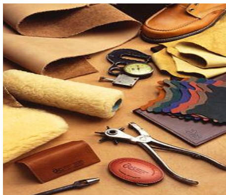
Fig 1. Leather materials

The preparatory stages are when the hide/skin is prepared for tanning. Preparatory stages may include: preservation, soaking, liming, unhairing, fleshing, splitting, reliming, deliming, bating, degreasing, frizing, bleaching, pickling, and depickling.