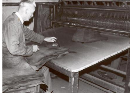
Fig 2. Pinwheel Mechanism

This action through a complex series of wheels and steel tapes attached to levers transmits the movement to a dial gauge which records the area of the leather.