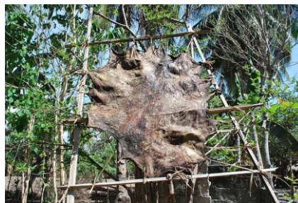
Fig 4. Example of leather crusting

According to previous calibration the area of that piece is calculated.