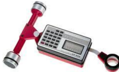
Fig 3. Roller Planimeter

The popular Roller Planimeter are more economical for leather area measurement.