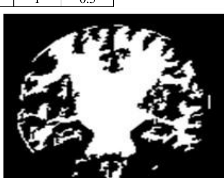
Fig. 3 Segmented image.